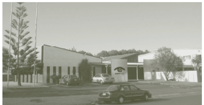
Image Centre in Ponsonby, Auckland, a 35,000m 2 site

Direct Capital's interest in Image Centre is a further investment in the communications sector, following its previous investments in leading print and database solutions providers, Moore and Gallaghers, which merged last year.